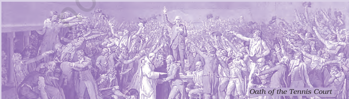
Oath of the Tennis Court

CONSTITUENT ASSEMBLY DEBATES (CAD), VOL. I