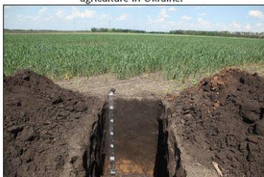
Fig 1: Chernozem (shown) is nutrient-rich dark soil that is essential for agriculture in Ukraine.