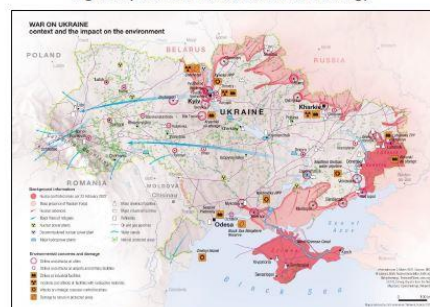
Fig 1: Impact on Protected areas and Ecology