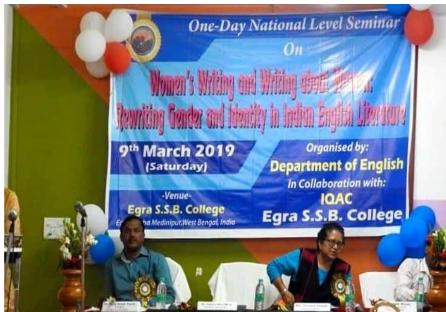
Fig. 1. Banner of One Day National Level Seminar on “One day National Level Seminar on “Writing about Women: Rewriting Gender and Identity in Indian English Literature”