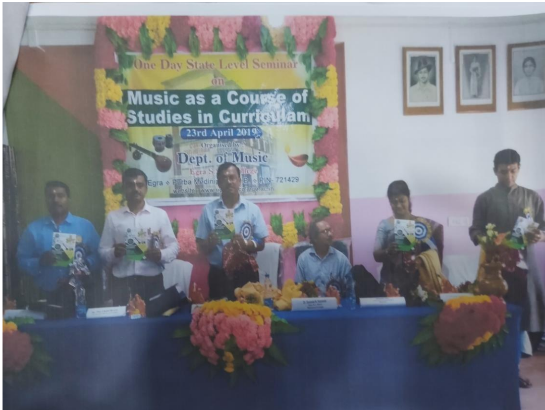
Fig:1 One Day State Level Seminar on Music as A Course of Studies in Curriculum