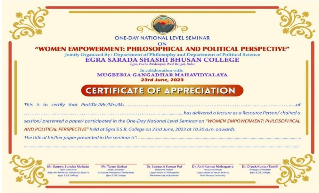
Fig: Certificate of “Women Empowerment: Philosophical and Political Perspective”