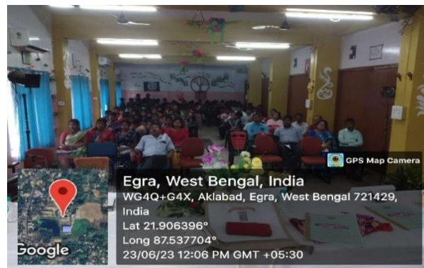
Fig: One Day National Level Seminar On

“Women Empowerment: Philosophical and Political Perspective”