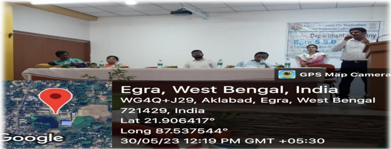
Pic: 1. Inaugural Programme of Horticulture and Mushroom Courses of Dept of Botany