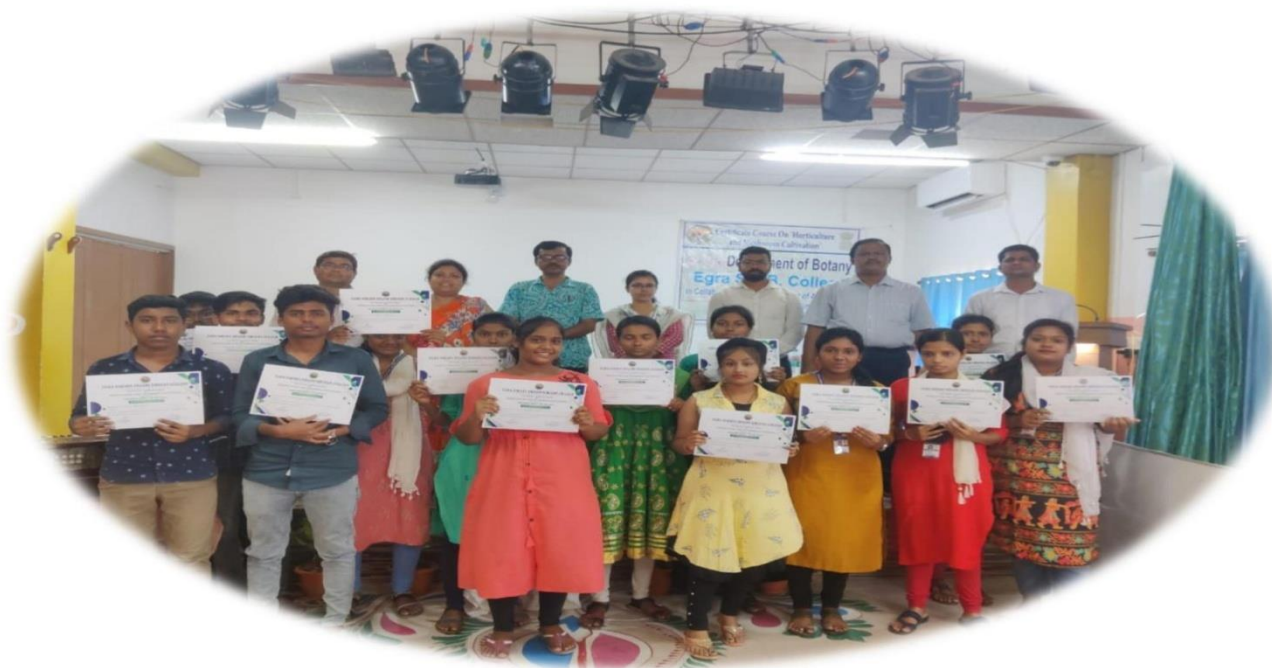
Pic:3. Students with Certificates of Horticulture and Mushroom of Dept of Botany