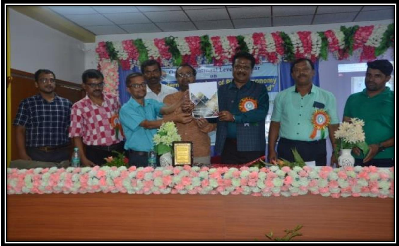
Fig:2. Opening of Abstract Book of one day National Seminar on “Modern approaches of Plant Taxonomy in present scenario of research field