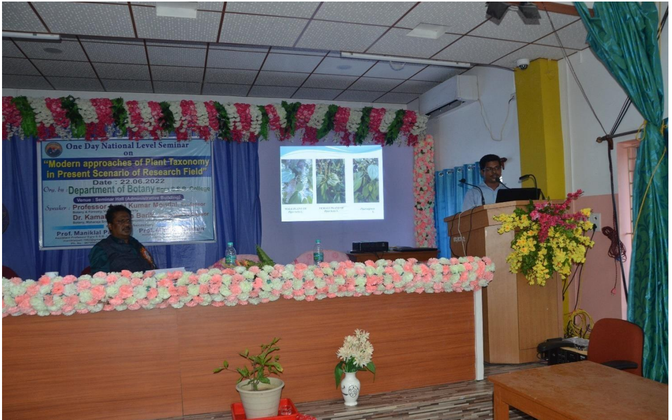
Fig:4. Oral Presentation by research scholar in “Modern approaches of Plant Taxonomy in present scenario of research field”