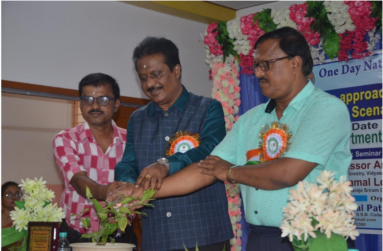
Fig:1. Inaugural session of one day National Seminar on “Modern approaches of Plant Taxonomy in present scenario of research field”