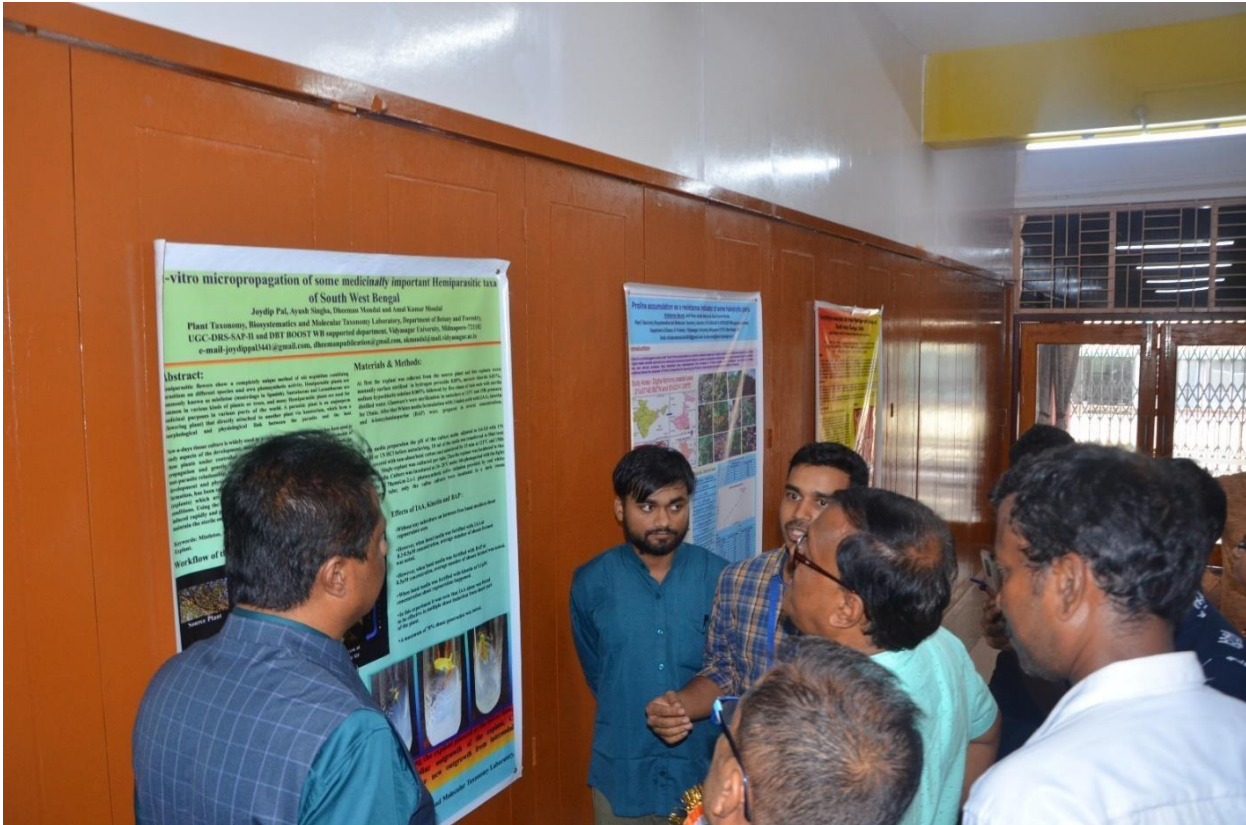
Fig.3. Poster presentation by research scholar in “Modern approaches of Plant Taxonomy in present scenario of research field”