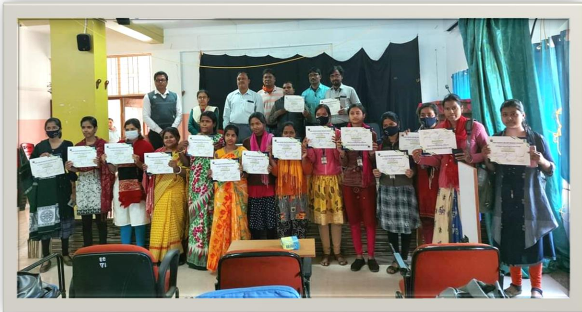
Pic: 1. Certificate distribution of Mushroom Cultivation certificate Course