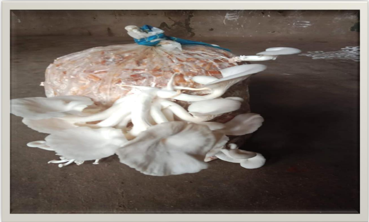
Pic: 2 Pleurotus sp. Mushroom production by Our Students

☎ : 03220-244073, Website - www.egrassbcollege.ac.in : E-mail – info@egrassbcollege.ac.in